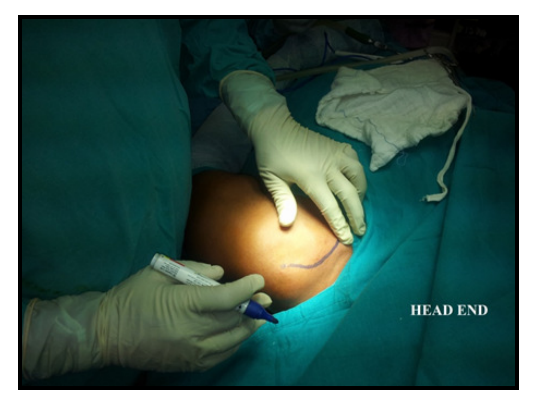
Figure-4: Left AC joint exposed.

Figure-3: Surgical marking done using sterile surgical marker.