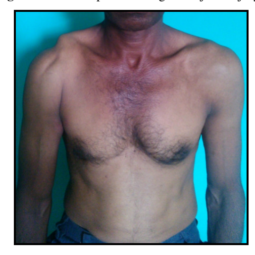
Figure-1: Clinical picture of right AC joint injury

Imaging: Imaging of the AC joint was done using anteroposterior view of the affected shoulder (fig. 2).