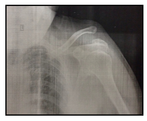
Figure-2: Plain radiograph of left shoulder joint in AP view showing grade V left AC joint injury.

Surgical technique: Under a suitable anaesthesia patient given supine position with a sand bag beneath the scapula of the operating side. Surgical marking done using a sterile surgical marker (fig. 3). Transverse incision taken over lateral 2/3<sup>rd</sup> of clavicle extending upto the acromion lateral tip. Lateral end of clavicle exposed by elevating deltoid muscle subperiosteally and the acromioclavicular joint is exposed (fig. 4). Coracoid process is identified after blunt dissection. Two holes made in clavicle, one hole at conoid tubercle and one hole at trapezoid ridge. Mersilene tape passed under coracoid process and then passed through these holes and tied over clavicle to correct superior displacement and to replicate the anatomy (fig. 5). Two holes made on either